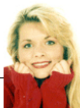
CyberSpeak Kim Komando